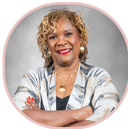
Brenda Jackson Keynote Speaker

Brenda Jackson is a trailblazing romance author whose career began with her debut novel Tonight and Forever in 1995. She has since published over 155 books and novellas, selling more than 50 million copies worldwide and earning numerous national literary awards. Jackson made history as the first African American romance author to appear on both the New York Times and USA Today bestseller lists and received the prestigious Nora Roberts Lifetime Achievement . Her book "A Silken Thread" earned her a 2012 NAACP Image Award Nominee for Outstanding Literary Fiction. Brenda's literary magic continues to shine on the silver screen, with several of her books brought to life in captivating cinematic adaptations.