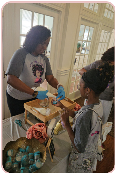
The Hair & Skin Club