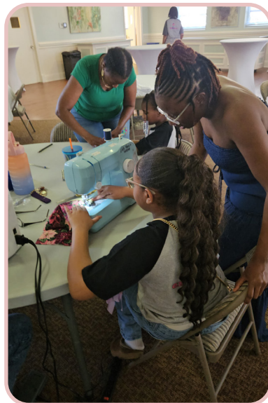
The Sewing & Fashion Club